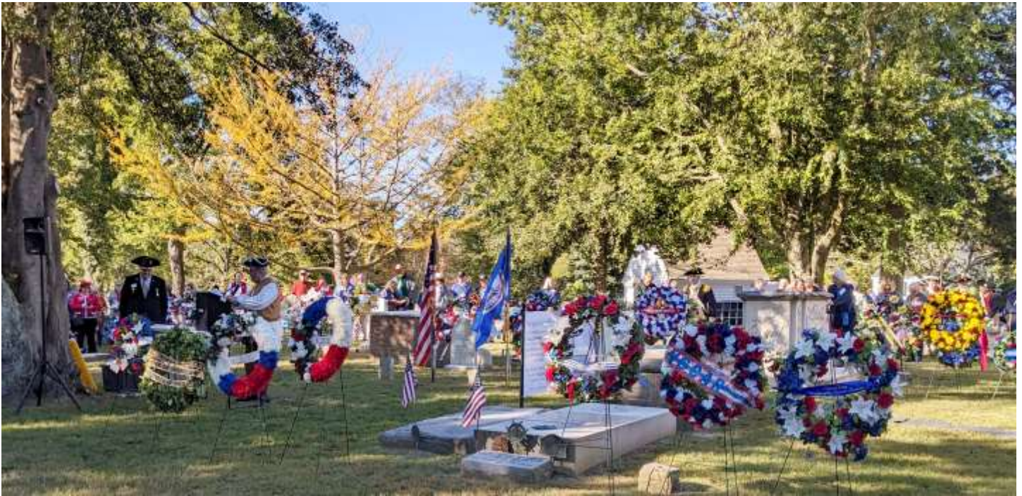
Wreath Laying Ceremony during the 243 rd Anniversary of Battle of Yorktown Victory celebration