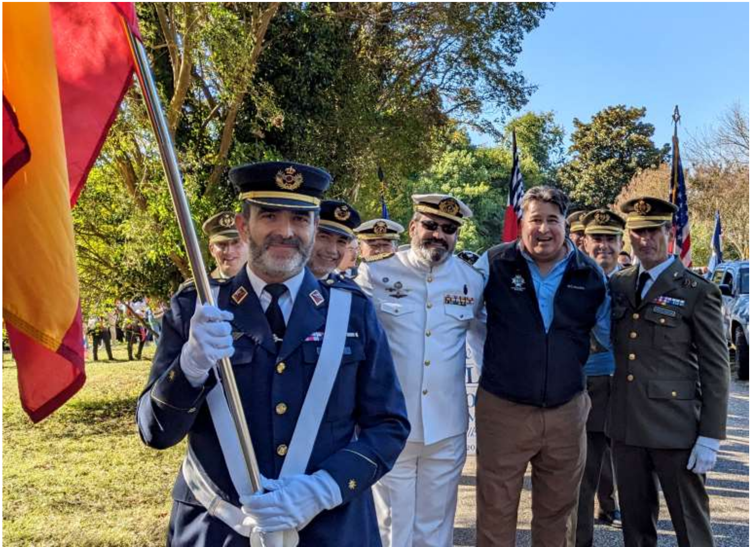
Spain was well represented Spanish Army, Navy, Air Force members as well as a descendent of Spanish Patriots of the American Revolution.